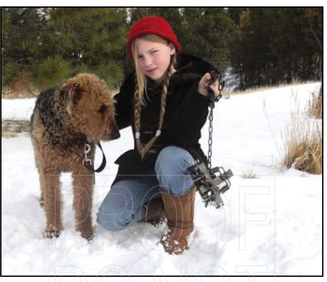
Polly the Airedale has survived three traps

Traps are hidden and baited. Traps are indiscriminate. Traps can be almost anywhere